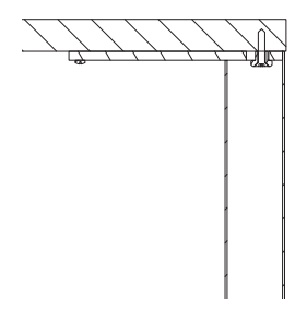
Central hidden fastening.